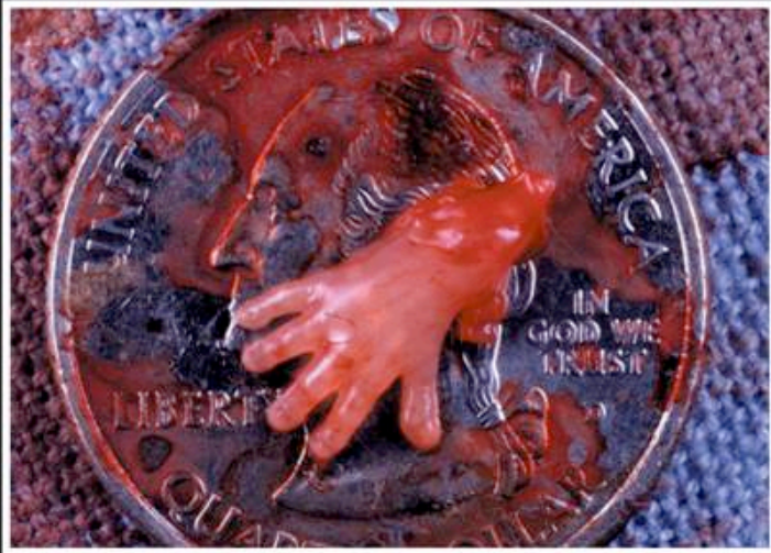
FIRST TRIMESTER (10 WEEK) ABORTED FETUS